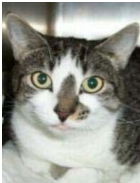
Princess – Page 5