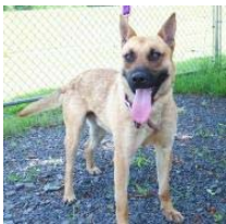
Magnum – Page 5

SCFA meetings are held the first Tuesday of each quarter: January, April, July and October at the Senior Citizen Community Center.