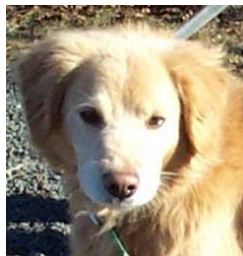
Charlie – Page 5